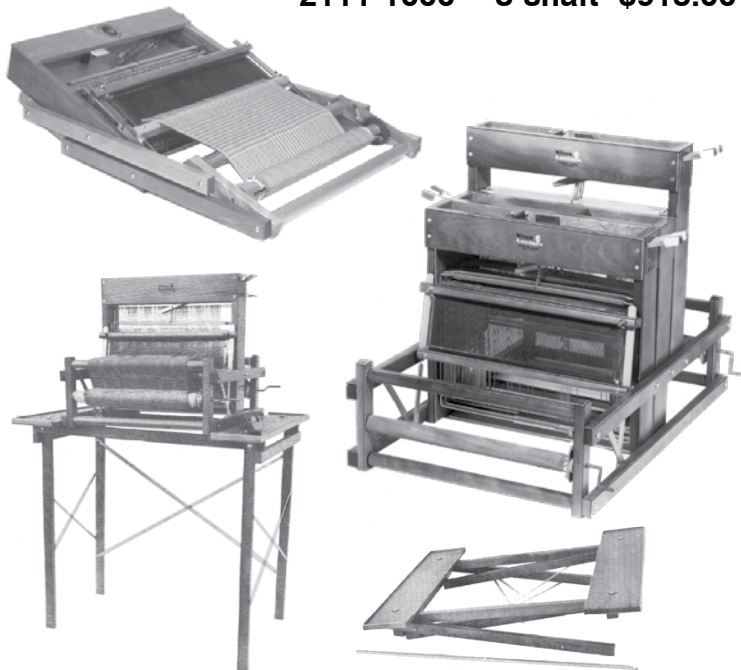
TABLE FOR DOROTHY 15 3 / 4 " 4s

2110-0000 4 shaft $675.00 2111-1000 8 shaft $915.00